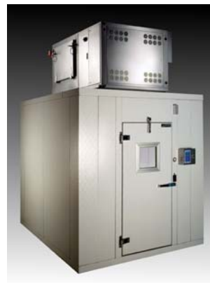
10' x 10' room with 700 CFM conditioner