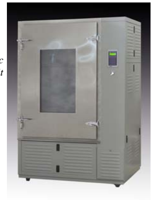
30 cubic foot unit

Controlled Spaces from 4.5 to 1000 Cubic Feet