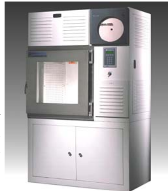
4.5 cubic foot unit (shown with optional base cabinet and recorder)

All units are equipped with a SmartPad controller which includes automatic ramping, alarms, and a digital communications port.